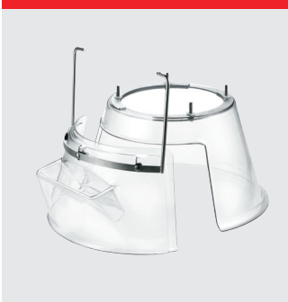
Fixed safety guard in plastic. CE-certified