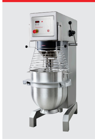
Marine version, stainless steel