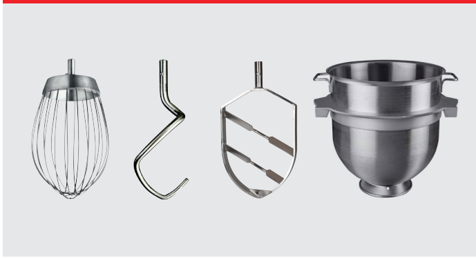
Whip, hook, beater and bowl 100 liter in stainless steel.