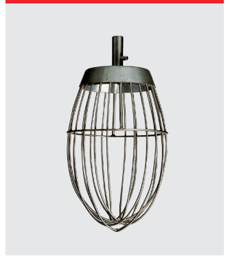
Whip with reinforcement