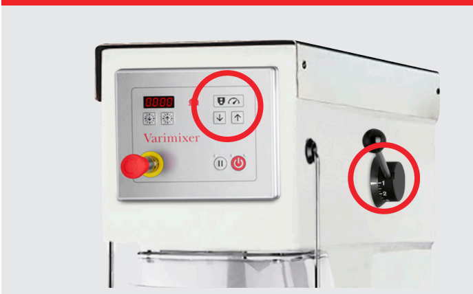
VL-1L – Manual speed regulation and automatic bowl lowering