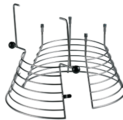
Fixed safety guard in stainless steel. Not CE-certified