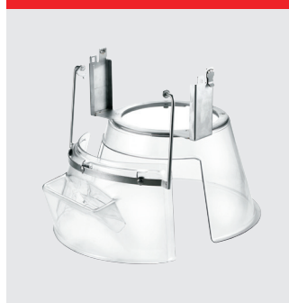
Removable safety guard in plastic. CE-certified