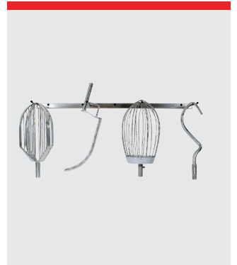
Tool rack, 127 cm