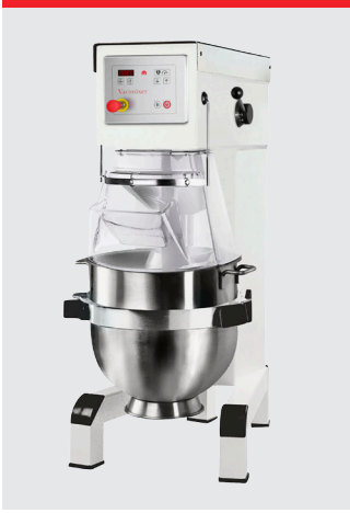
White, powder coated