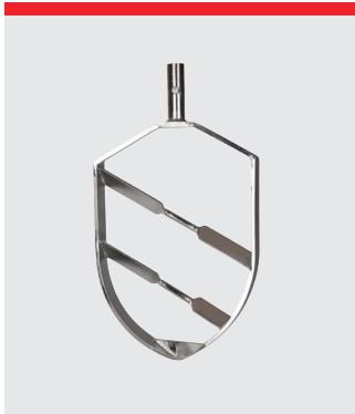
Beater, stainless steel