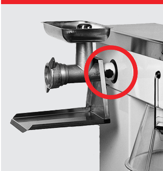
Attachment drive for meat mincer and vegetable cutter