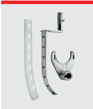
Automatic scraper, stainless steel. Nylon or teflon blade. 30L and 30/15L.