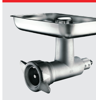
Meat mincer, 82 mm