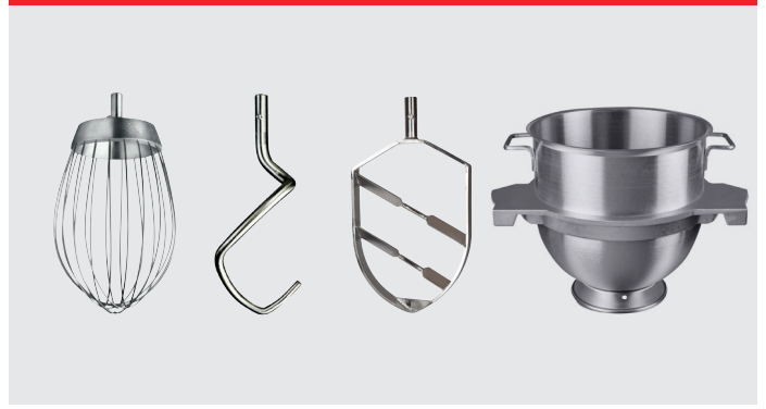
Whip, hook, beater and bowl 30/15 liter in stainless steel.