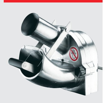
Vegetable cutter GR20