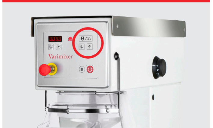
VL-1S – Automatic speed regulation and automatic bowl lowering