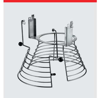
Removable safety guard in stainless steel. Not CE-certified