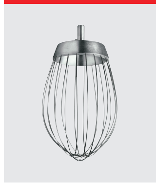
Whip with thinner wires, stainless steel