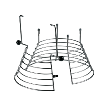
Fixed safety guard in stainless steel. Not CE-certified