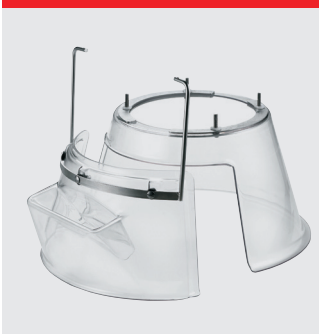
Fixed safety guard in plastic. CE-certified