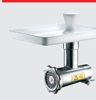
Meat mincer, 70 mm