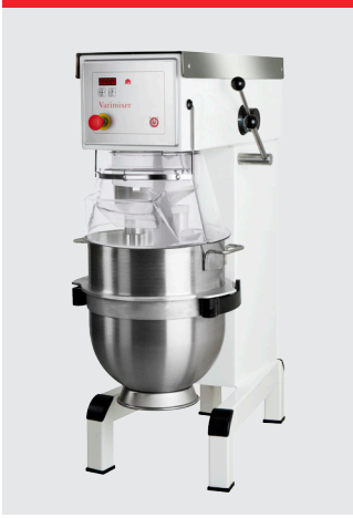
White, powder coated