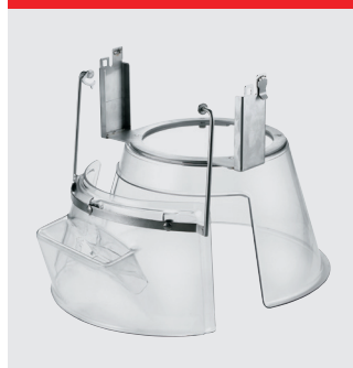
Removable safety guard in plastic. CE-certified