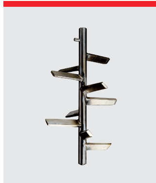
Powder mixer, stainless steel