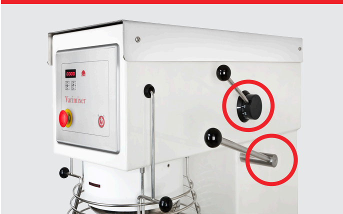
VL-1 – Manual speed regulation and manual bowl lowering