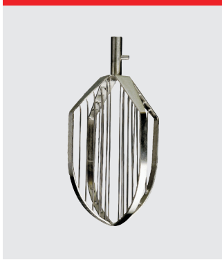
Wing whip, stainless steel