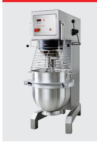
Marine version, stainless steel