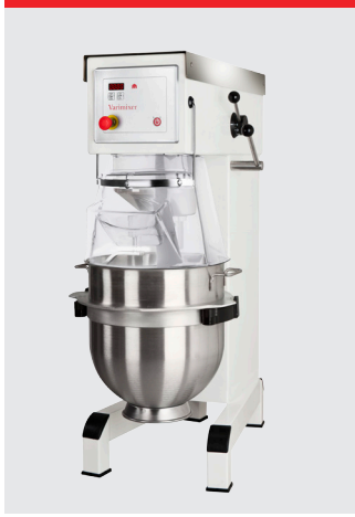
White, powder coated