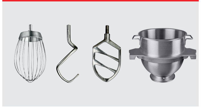
Whip, hook, beater and bowl 60/30 liter in stainless steel.