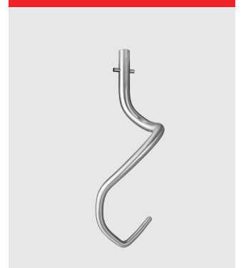
Double pinned hook for pizza