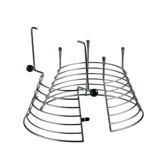
Fixed safety guard in stainless steel. Not CE-certified