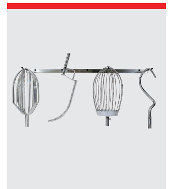
Tool rack, 127 cm