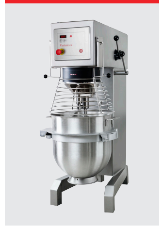
Marine version, stainless steel