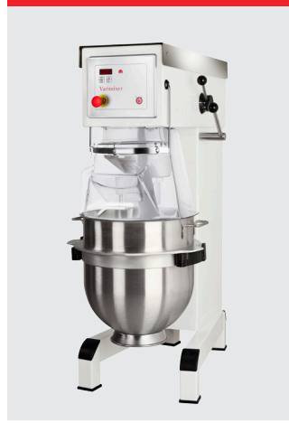
Pizza version, white, powder coated