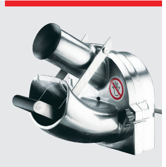
Vegetable cutter GR20