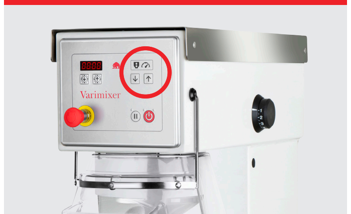
VL-1S – Automatic speed regulation and automatic bowl lowering